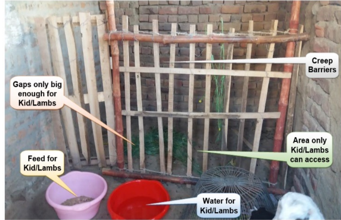
Example of creep feeding system