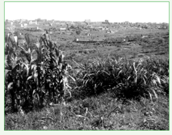
Use of untreated waste water from broken sewer pipes such as this is not uncommon. This practice poses great health risks to unsuspecting consumers of these vegetables.

Rapid urbanisation in developing countries has intensified the role of peri-urban agriculture in providing cheap food, employment and livelihoods to small-scale farmers and traders. About 25% of Nairobi's fresh vegetables come from peri-urban chains that are characterised by extensive use of untreated waste water and overuse of pesticides and fertilisers. In addition, chain members have low levels of resources, skills and technologies; land use is unregulated; markets are congested and dirty; customer service is poor; and sharing of market information is limited. Conversely, consumers want cleaner, safer, yet affordable vegetables; chain members need higher returns; and the government wants production and marketing activities that do not threaten food safety, public health and the environment.